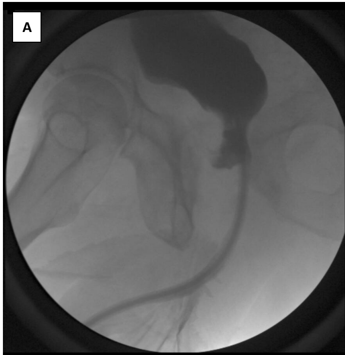
Figure 4A and 4B. Voiding cystourethrogram performed 2 months post leak repair. There is no contrast extravasation visualized after (A) the bladder is filled with contrast; and (B) after bladder emptying.