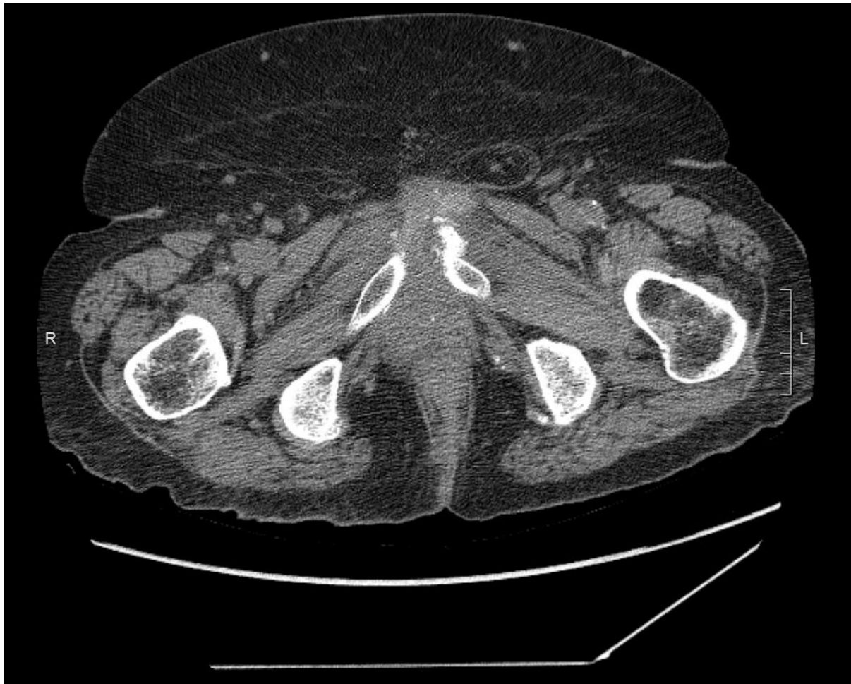
Figure 1. Periosteal reaction and asymmetry of the pubic rami concerning for osteomyelitis.