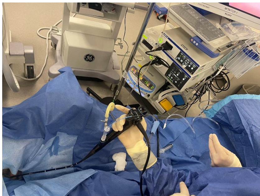
Figure 4. Ureteric catheter loaded as pusher.