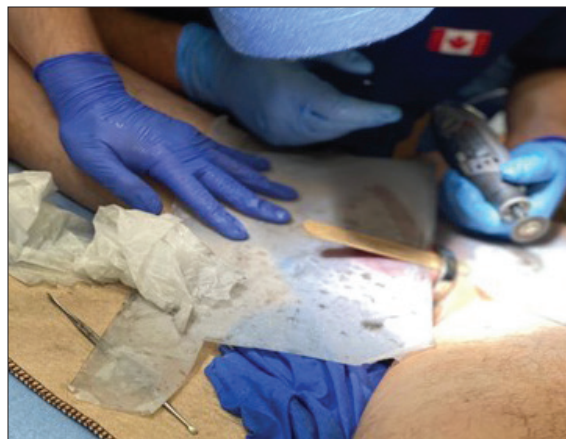
Figure 3. Plastic cards used to protect skin.

Trivedi et al emphasize the diverse clinical presentation and management approaches encountered with penile constriction devices. 13 Consequently, individualized judgment on a case-by-case basis has proven