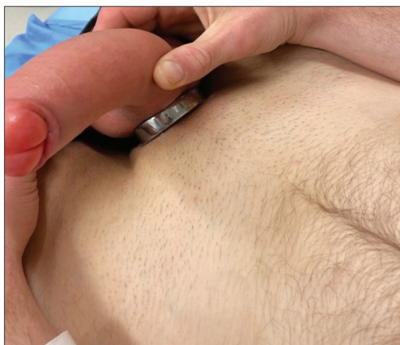
Figure 2. Patient presentation.

ally or in combination, for the removal of penile rings; 10,11 however, in cases characterized by pronounced penile edema, conventional methods may prove inadequate, as evidenced in our patient's scenario. Notably, Kyomukama et al have documented the effective use of an angle grinder metal cutter, complemented by accessories, offering an alternative technique for ring extrication. 12