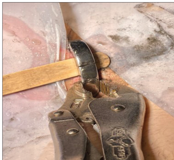
Figure 4. Tongue depressor under the penile ring to protect skin.