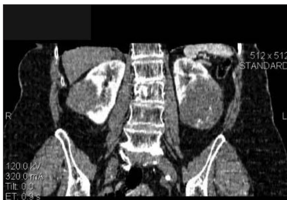
Fig. 3. Contrast-enhanced abdominal CT. The coronal slice demonstrates a 7-cm left cystic renal cell carcinoma and a 4-cm right cystic renal cell carcinoma.

Aortic surgery following renal allograft transplan-