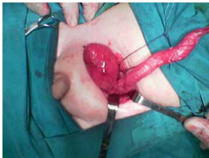
Fig. 3. Atrophic left kidney and dilated, tortuous ureter (intraoperative view).

Unilateral polycystic renal disease, multicystic renal dysplasia and renal aplasia are all synonymous with renal dysplasia, which is a rare pathological condition. 7 The association of crossed renal ectopy with renal dysplasia is very rare and a few of these cases were reported. 8,9 In our patient, histopathological examination was reported as multicystic renal dysplasia. In most cases with multicystic dysplastic kidney, no functional parenchyma is present. Intravenous urography and isotope renography show the function of the orthotopic kidney, but also the lack of function in the ipsilateral lower mass and contralateral flank. Consistent with this finding, the DMSA and DTPA studies demonstrate no function in an ectopic kidney.