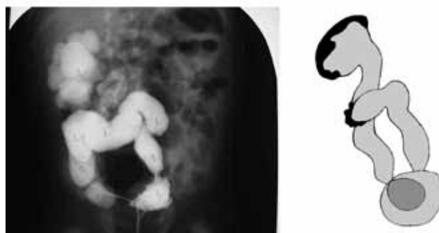
Fig. 2. Right hydronephrosis (labelled 2) and left ectopic kidney and dilated tortuous left ureter (labelled 1) and schematic diagram.

The pathophysiological conditions leading to crossed renal ectopy remain unknown. Faulty development of the ureteric buds, vascular obstruction during the ascent of the kidneys and environmental factors are accused. The most probable cause of crossed renal ectopy was abnormal development of the ureteric bud during the fourth to eighth weeks of gestation. 5 In 90% of patients, the crossed kidney was fused with the normal kidney. Crossed renal ectopy anomaly is two times more common in males and the cross from left to right was more common than the cross from right to left. 6 Nussbaum and colleagues 2 determined the classical visualisation findings of multicystic dysplastic kidney and crossed renal ectopy necessary for the diagnosis: (1) a multicystic mass of variable size that is contiguous with the lower pole of a hydronephrotic, malrotated kidney; (2) ureteral displacement and/or dilatation; and (3) contralateral absence of the kidney and its renal artery. Consistent with previous reports, our patient was male and the cross was from left to right and all the classical visualisation findings were present, except that the crossed kidney had not been fused with the normal kidney.