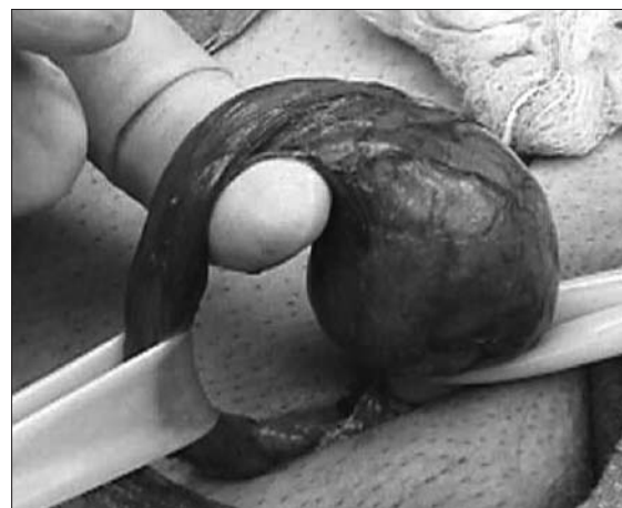
Fig. 1. Testicle delivered through the subinguinal incision depicting the spermatic cord (held by Penrose drain; bottom left) and the gubernaculum (held by Penrose drain; right).

To simplify the procedure and protect the vas deferens and its vessels from potential injury dur-