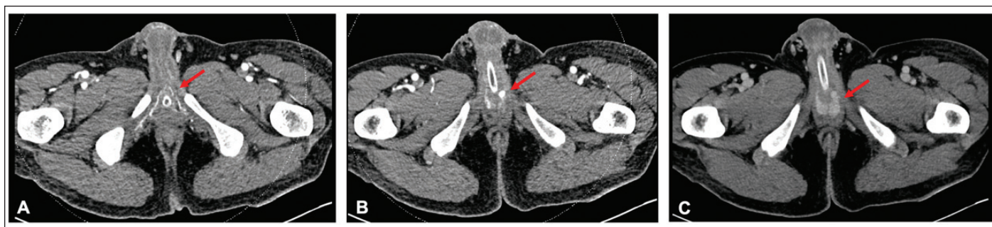
Figure 1. Computed tomography angiography, transverse section at the level of the pelvis. (A) Left dorsal artery on arterial phase (arrow); (B) pseudoaneurysm of left dorsal artery (arrow); (C) Contrast pooling in bulbar urethra on 10 second delayed contrast phase (arrow).

diagnosis is typically made by diagnostic imaging in the form of CT angiography and, at times, focused ultrasound or invasive angiography. 6 In their case, Bettez et al highlighted a cystoscopic diagnosis of a pulsatile mass within the bulbar urethra. 5 Regardless of diagnostic strategy, it is imperative to have prompt and timely recognition of this complication.