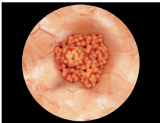
Fig. 2. The edges of the tumor are demarcated with a narrow margin of macroscopically normal mucosa.