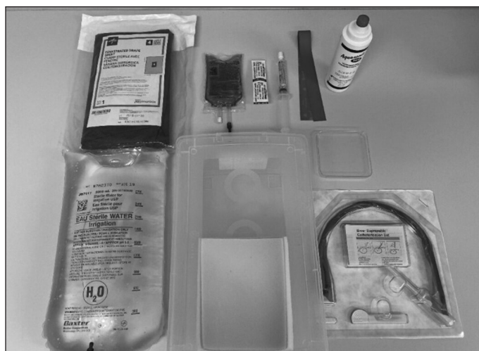
Fig. 1. Suprapubic catheterization (SPC) model components.

The SPC simulator was developed using six primary components (Fig. 1). A plastic shoebox-size container with a snap-on lid served as the housing for the components. At one end of the lid, a 12 cm x 12 cm hole was cut to allow for an access point to serve as the “field.” The distended bladder was simulated using a 3 L normal saline or sterile water irrigation bag wrapped with a rubber tourniquet to place it under pressure.