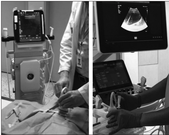
Fig. 3. Suprapubic catheterization (SPC) model in use with ultrasound.

the five-point Likert scale, higher scores indicated stronger agreement with the statement. The questionnaire was divided into three domains: anatomic realism (six questions), usefulness as a training tool (five questions), and overall/global reaction (five questions). The detailed results from each domain are described in Table 3, including mean scores and standard deviations (SDs) for urologists, IRs, and in aggregate. With respect to all rated items, for urologists the mean scores ranged from 4.0–4.6, for IRs they ranged from 3.0–4.8, and in aggregate the range was 3.7–4.6. The overall domain scores were similar between groups. “Anatomic realism” was scored the lowest among the domains, with urologists’, IRs’, and aggregate scores of 4.1 ( \pm 0.95 ), 3.7 ( \pm 0.84 ), and 3.9 ( \pm 0.94 ), respectively. The domain “usefulness as a training tool” received the second-highest scores, with urologists’, IRs’, and aggregate scores of 4.2 ( \pm 0.89 ), 4.2 ( \pm 0.85 ), and 4.2 ( \pm 0.89 ), respectively. “Overall/global reaction” was rated the highest aspect of the model, with