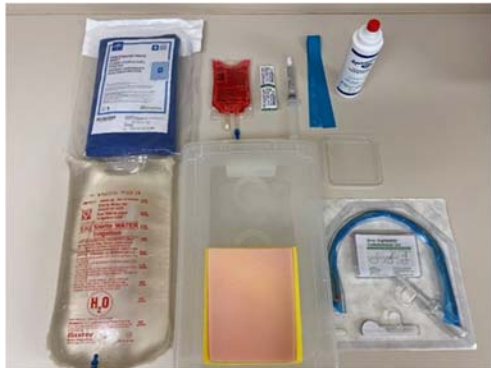
Fig. 2. Suprapubic catheterization model ( A ) and when draped ( B ).