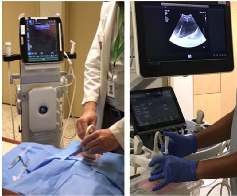
Fig. 4. Suprapubic catheterization practice during urology boot camp.