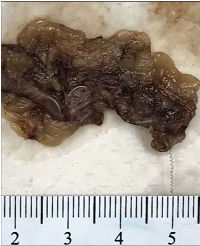
Fig. 3. Gross specimen of the excised, embolized, right testicular vein. The specimen consists of fibroadipose and vascular tissue with an overall measurement of 10.5 cm x 2.0 cm x 0.5 cm. Centrally running almost the full length of the specimen is a metallic coil. No significant histopathological abnormality noted.

vascular perforation and contrast extravasation, hydrocele formation, and/or venous thrombosis. 2,5,6 In a systematic review, only two studies discussed venous perforation and contrast extravasation following embolization. 7 In one study, perforation of the testicular vein occurred during catheterization, with no difference in the mean pain level between groups with and without perforation. 8 Conversely, our patient appeared to gradually experience coil erosion and chronic pain post-embolization, which may have occurred with bodily movements over time. 6 Pathophysiology aside, this case report adds a major complication of varicocele embolization not previously reported in the literature.