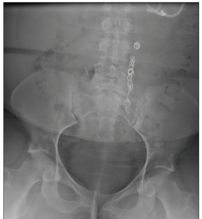
Fig. 1. Plain-film radiograph depicting left-sided endoureteral coils causing obstruction. A left-sided percutaneous nephrostomy tube can be seen at the upper aspect of the image providing urinary drainage for this obstructed collecting system.

Following initial consultation with gynecologic oncology, she was referred to interventional radiology in consultation for management, and the decision was made to attempt fistula embolization with endoureteral coil placement. Urology was not consulted. While the persistent incontinence improved, she subsequently developed chronic left flank pain from the PCN and developed recurrent episodes of cystitis and pyelonephritis. Following several years of PCN-based management by her primary team, the patient was referred for urological consultation to review definitive management for her chronic indwelling PCN and to achieve relief of flank pain and recurrent infections. She denied