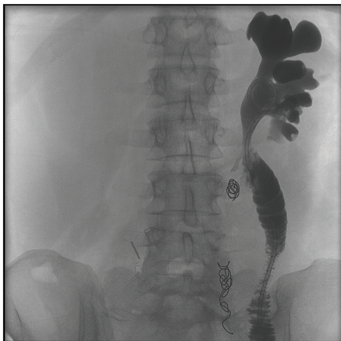
Fig. 4. The proximal aspect of the ileal ureteral substitution can be seen with anastomosis to the left renal pelvis. The indwelling ureteral stent is visualized.

ureterovaginal fistula treatment. Permanent ureteral embolization with permanent chronic nephrostomy placement is unacceptable as definitive management in a young and otherwise healthy patient with no evidence of disease and a good prognosis. This case highlights the importance of a timely and accurate diagnosis and expedited management of urinary fistulae to minimize patient morbidity. Early urological consultation in this case might have spared this patient a destructive procedure and unnecessary repetitive followup procedures.