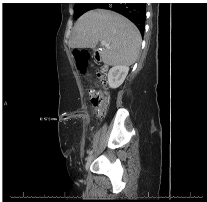
Fig. 1. Computed tomography of the abdomen and pelvis after initial continent catheterizable stoma creation. Skin to fascial distance measures 57.9 mm.

The abdominal cavity was entered via the prior midline abdominal incision and adhesiolysis was performed, isolating and releasing the catheterizable channel of tapered ileum. The channel was dissected away from the skin and subcutaneous adipose with cautery using a Colorado tip. The channel was grasped with a Babcock clamp and inverted through the fascial defect.