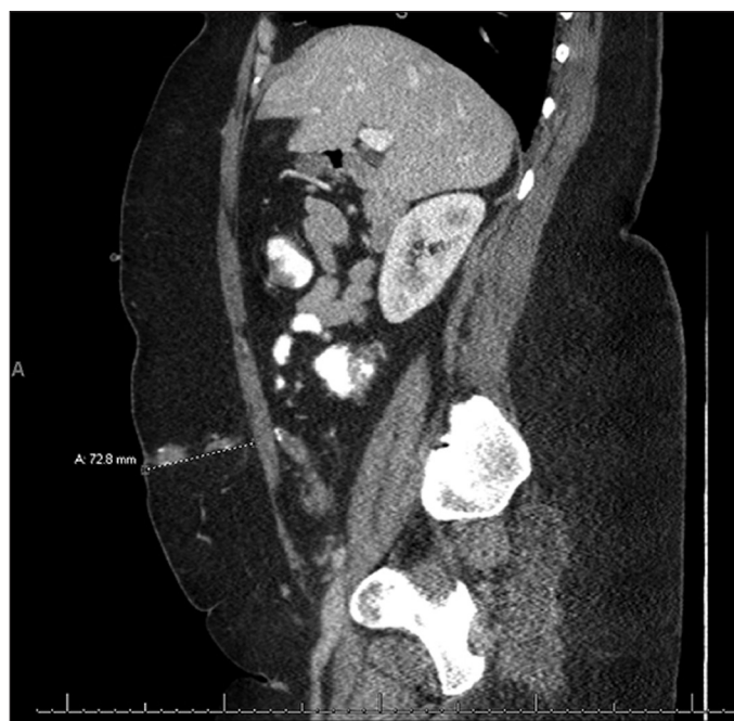
Fig. 2. Computed tomography of the abdomen and pelvis at maximal body mass index. Skin to fascial distance measures 72.8 mm.

Once the efferent channel was disconnected from the fascia, buckling of the channel was noted adjacent to the ileocecal junction when passing an 18F red rubber catheter. A single 2-0 polydioxanone suture was placed in a Lembert fashion under the area of buckling for reinforcement, and the catheter was then easily passable into the augmented bladder. After the plastic surgeon had raised skin flaps and removed excess tissue in anticipation of panniculectomy, the stoma was re-sited through the rectus muscle and fascia, up to the level of the skin, away from the pre-existing hernia. The channel was straightened and shortened by removing 3 cm from the distal end. The channel was spatulated on the anti-mesenteric side and secured to the skin with polyglactin sutures. The channel was also secured to the anterior abdominal wall with a 3-0 polydioxanone to further facilitate straightening the channel. The bladder was then refilled with 600 mL, confirming absence of leakage from the channel, and a 14F catheter was easily passed with return of clear fluid. Lastly, the general surgeon performed repair of the parastomal hernia with bio-absorbable mesh, and the plastic surgeon completed the panniculectomy. A 14F stomal catheter with a catheter plug, and a 16F Foley catheter were in place at the conclusion of the procedure.