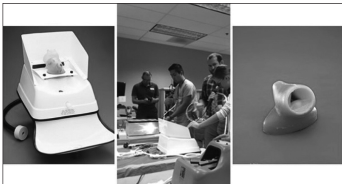
Fig. 1. Bristol transurethral resection of the prostate trainer. From manufacturer ( https://limbsandthings.com/uk/ ). A complete training system for the transurethral resection of the prostate (TURP) using monopolar and bipolar electrosurgery. This model was developed in conjunction with the Institute of Urology, Southmead Hospital, Bristol, UK. Skills: Fluid management; insertion, manipulation, and removal of instruments; identification of anatomical landmarks and tissue types; resection techniques within lifelike spatial constraints; evacuation of chips and bladder flushing.

Participants completed a 62-question MCQ that included the questions on the baseline MCQ and additional questions related to course content covered during the boot camp. The 31 questions on the pre-course questionnaire were randomly dispersed throughout the 62-question MCQ to control for order and recall bias. The 31 questions from the pre- and post-course MCQs were compared, while the new boot camp-specific questions on the post-course MCQ were scored separately for evaluation purposes only. A six-station OSCE