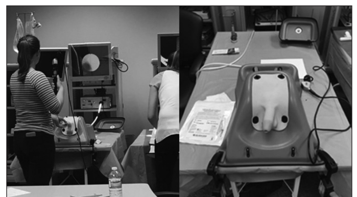
Fig. 2. Uro-scopic trainer. From manufacturer ( https://limbsandthings.com/uk/ ): A versatile model that provides for a range of urological endoscopic techniques and procedures to be acquired in line with a trainees clinical progression. Skills: Fluid management; insertion, manipulation and removal of instruments; examination of the urethra (urethroscopy); examination of the bladder (cystoscopy); examination of the ureters using rigid or flexible instruments (ureteroscopy); stent and guidewire insertion; lithotripsy; stone retrieval.