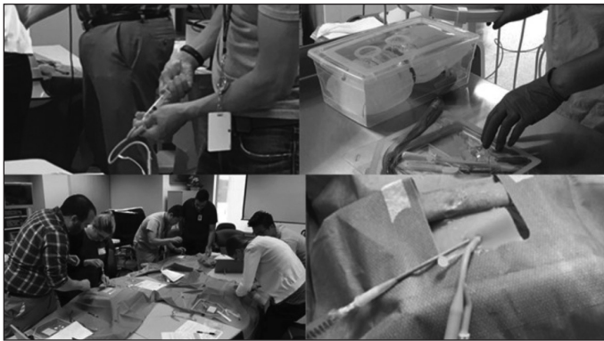
Fig. 3. Suprapubic catheter insertion simulator – ultrasound-compatible. This model was created by our team for the urology boot camp and has since been validated. It has been used every year of the boot camp for practice and the OSCE. Multiple models are available for use throughout the boot camp. The model is comprised of the following: bladder – 3 L normal saline irrigation bag under pressure via tourniquet; rectum – 100 mL normal saline bag injected with red food coloring; skin layer – silicone skin model without layers purchased from a medical/surgical simulation company; subcutaneous tissue layer – ultrasound compatible agar gelatin in a 100 mm x 100 mm mold, which is 15 mm thick; housing – a shoebox-sized plastic box with a snap on plastic lid to provide stability (a square portion of the lid is cut out to simulate the suprapubic catheterization site); suprapubic catheter introducer kit – obtained from medical supplier; ultrasound gel – obtained from medical supplier; drape – reusable sterile draping to cover the box, with a hole cut into the drape to expose the simulated suprapubic catheterization site. The total cost of this model is $48 CAD.

was conducted at the end of the second day and included: scope assembly; flexible cystoscopy; patient positioning; gaining patient consent for ureteroscopy; management of gross hematuria; and suprapubic catheter placement. Assessment was mapped to key objectives from each topic taught, and participants answered multiple questions related to a simulated case presentation before completing the specific station’s technical skills-related task. The OSCE was evaluated by senior urology residents and staff urologists. Participants completed an exit questionnaire that repeated the baseline confidence survey and elicited qualitative feedback on the course. A Likert scale-based survey served as a formal course evaluation, followed by a semi-structured oral debriefing session with the boot camp instructors and facilitators to elicit suggestions for improvements, additions, and/or changes to course material. All evaluation metrics were identical over the three years. Post-course assessments were completed at the end of the second day before the debriefing session.