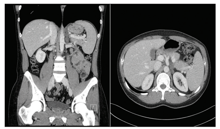
Fig. 1. Coronal and axial staging computed tomography performed one-month post-orchiectomy shows left supra-hilar para-aortic lesions described as low-density necrotic lymph nodes highly suspicious for metastasis. The superior para-aortic measuring 18 mm in long axis, with an inferior para-aortic node measuring 11mm in long axis.

for which the relapse rate is low; hence, the importance of a conservative approach.<sup>2</sup>