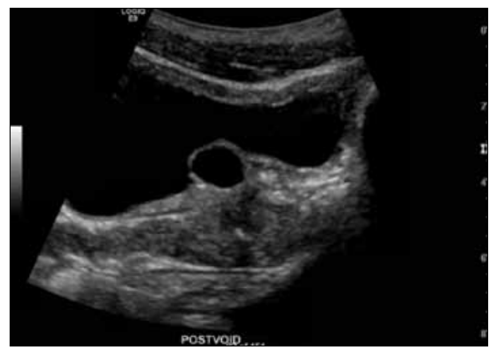
Fig. 1. Bladder ultrasound depicting cystic mass at anterior bladder neck.

Competing interests: The authors report no competing personal or financial interests related to this work.