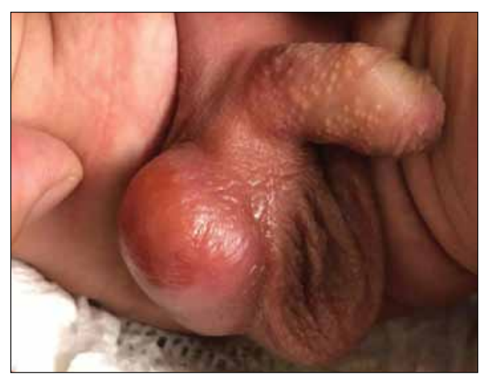
Fig. 2. Right-sided hemiscrotal swelling and erythema.

The Canadian Pediatric Society has published recent guidelines on salmonella infections in the pediatric population.<sup>12</sup> While the recommendation for empiric antibiotic treatment initially is ceftriaxone, our patient was commenced on ceftazidime due to