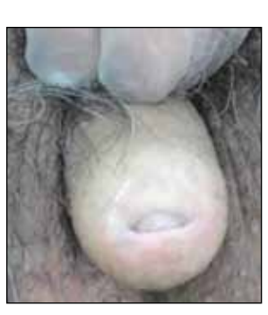
Fig. 6. Balanitis xerotica obliterans. Adapted from: Nemota K, et al. Balanitis xerotica obliterans with phimosis in elderly patients presenting with difficulty in urination. Hinyokika Kiyo 2013;59:341-6.

Topical therapies are attractive options due to relatively simple ease and ability to administer in the outpatient setting.