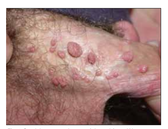
Fig. 3. Condyloma acuminatum. Adapted from: Wart, genital. Contributed by DermNetNZ, in StatPearls. 2018, StatPearls Publishing LLC.

Scabies is an infestation caused by a mite, Sarcoptes scabiei . The mites burrow tunnels into the horny layer of the epidermis. Multiple typical burrows and papules are often present on the glans penis, scrotum, and penis shaft. The chief clinical symptom is pruritus that is usually worse at night or after hot baths. The preferred treatment for scabies is permethrin 5% cream applied from neck to the feet, with special attention given to the perianal and genital areas, as well as to the free nail edge and folds, and then rinsed off after 8–14 hours.<sup>21</sup>