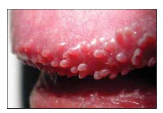
Fig. 2. Pearly penile papules. Adapted from: Badri T, et al. Papue, pearly penile. In StatPearls. 2018, StatPearls Publishing LLC.

A wide range of infectious dermatoses can affect the male genitalia. These include viral, mycotic, parasitic, and bacterial infections, with the most prevalent causative agents being human papilloma virus (HPV), herpes simplex virus (HSV), candidiasis, sarcoptes, chlamydia, and neisseria. Treatment is directed.