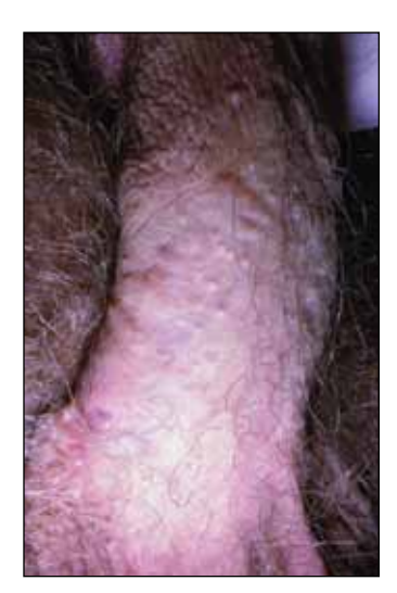
Fig. 1. Penile syringomas present as multiple flesh-coloured papules. Adapted from: Cohen PR, et al. Penile syringoma: Reports and review of patients with syringoma located on the penis. J Clin Aesthet Dermatol 2013:6:38-42.

14–48% of males.<sup>6</sup> The papules are flesh-coloured or white, dome-shaped or filiform (Fig. 2). Because of the benign nature of pearly penile papules, as well as their possible resolution with age, treatment is not indicated unless for cosmetic reasons. Healthcare providers may use ablative lasers for removal or liquid nitrogen as cryotherapy.