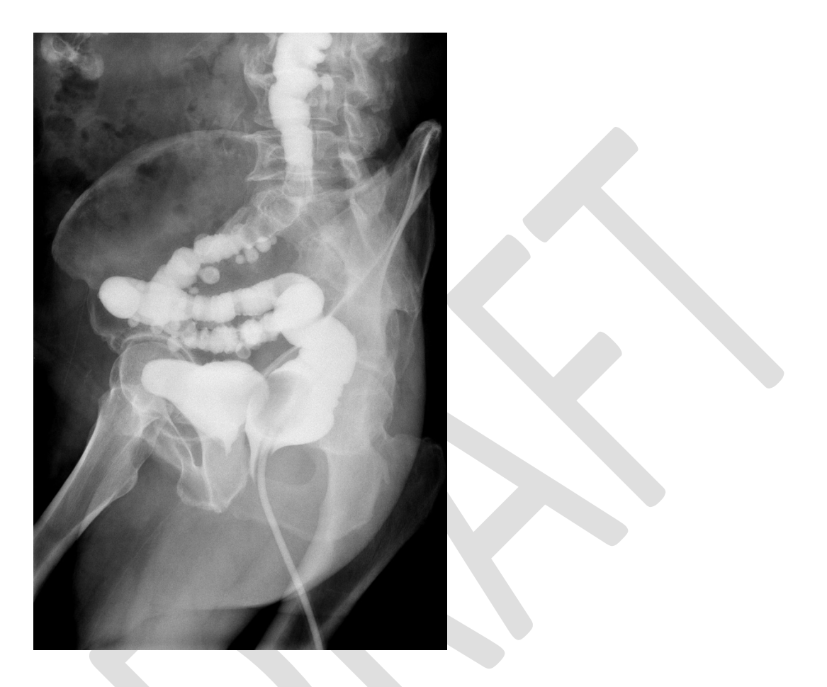
Fig. 1. Contrast barium enema showing persistence of the rectourethral fistula.