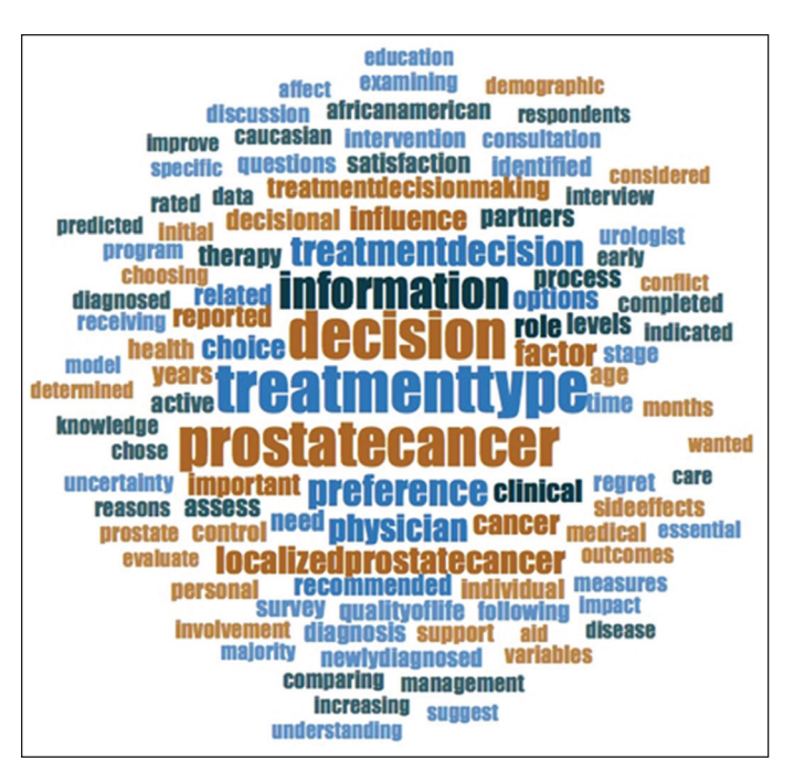
Fig. 2. Word cloud showing the most frequent words appearing in the titles and abstracts of the articles.

Regarding how treatment type may be involved in LPC treatment decision-making, some research suggest patients prefer surgery or radiation therapy due to the perception level regarding side effects and perceived treatment invasiveness. 12,14-16,21-23 Patients tend to prefer information on side effects or survival, which are different for each treatment type. 24-26 Other work suggests patients might avoid invasive treatments or choose complementary alternative medicine (CAM) or AS/WW because: 1) they prefer to avoid the side effects of curative treatments; 2) they are waiting for improvements in curative treatment options; and 3) they perceive curative treatments to be inconvenient or a burden. 9,11,13,27-29