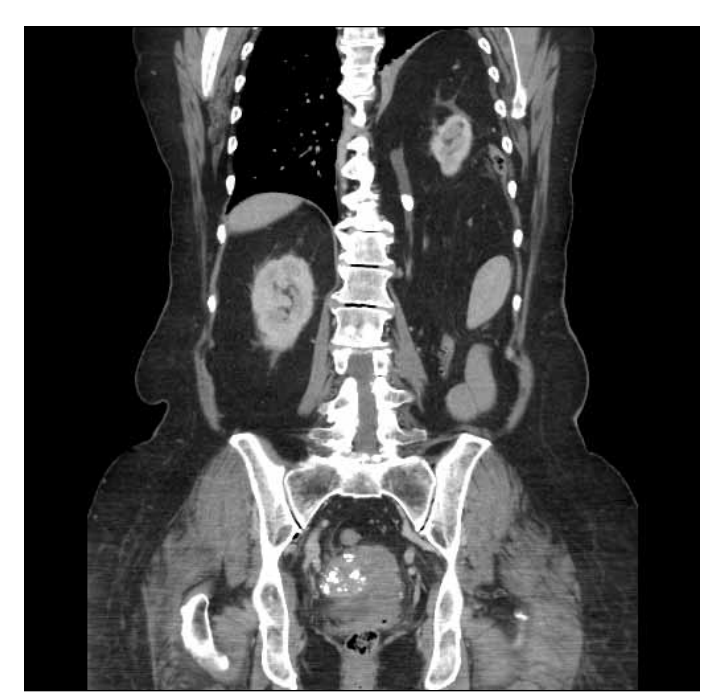
Fig. 3. Contrast enhanced coronal computed tomography image demonstrating the intrathoracic left kidney and the obstructing proximal left upper ureteric stone.