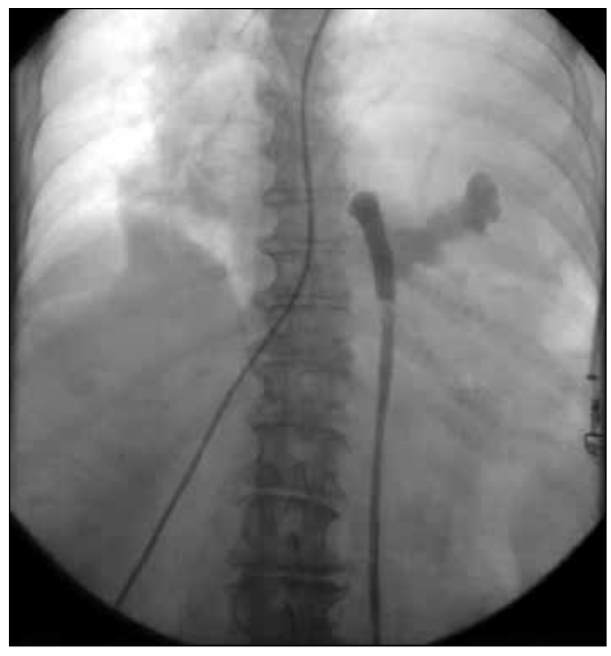
Fig. 4. Retrograde pyelogram demonstrating a proximal filling defect and malrotated collecting system.

Sharma P, Keenan RJ, Sexton WJ. Mass in solitary intrathoracic kidney within Bochdalek hernia. Urology 2016;97:e15-6. https://doi.org/10.1016/j.urology.2016.08.017