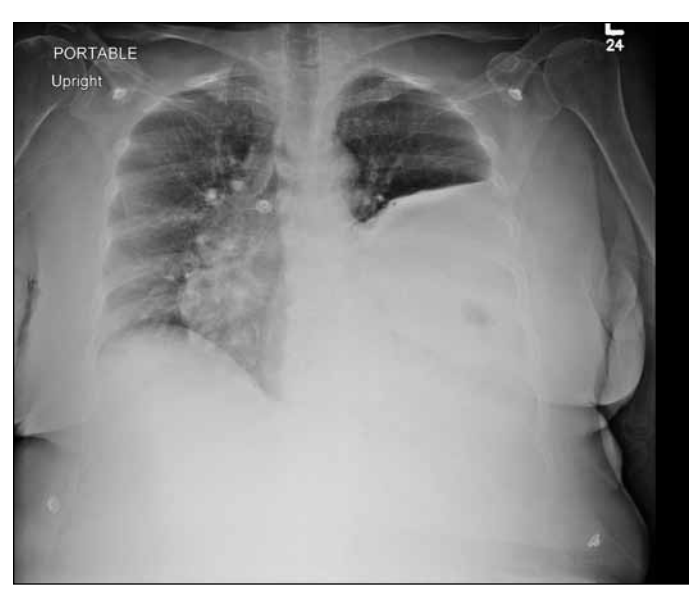
Fig. 1. Portable upright chest x-ray showing the elevated left hemidiaphragm with resultant diminutive left lung volume and rightward mediastinal shift.