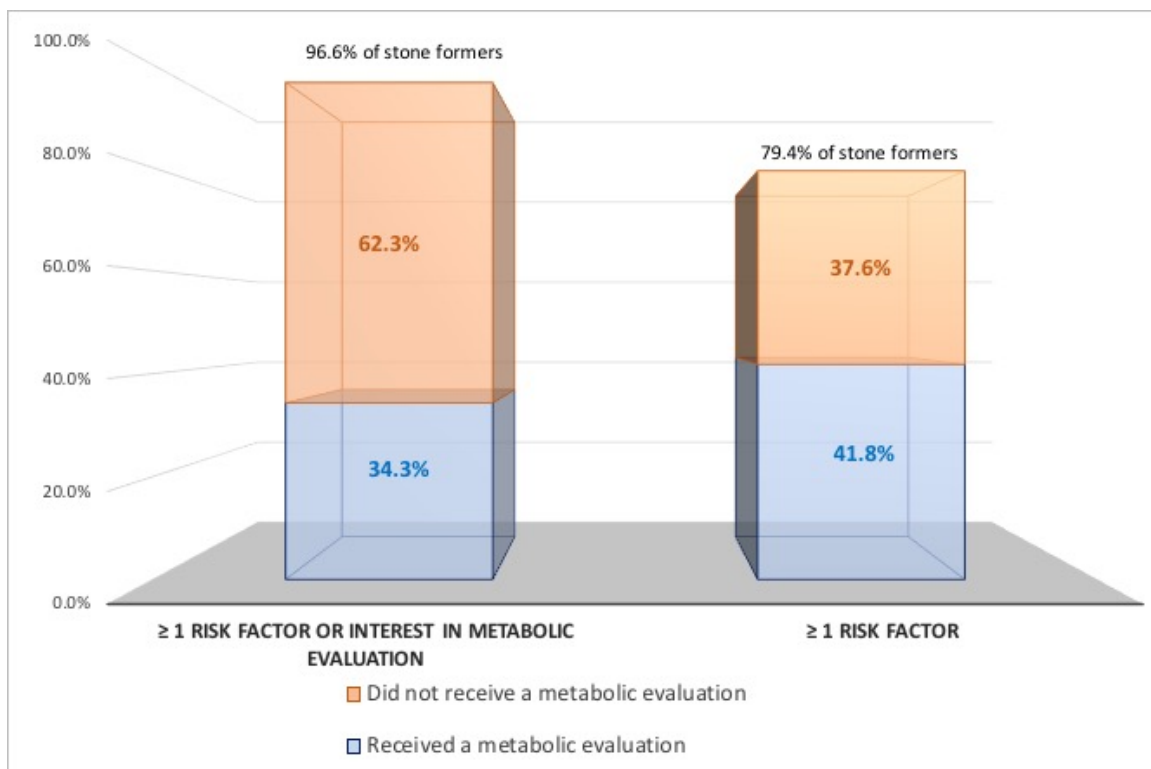
Fig. 1. Metabolic evaluation prescription patterns in a Canadian population of kidney stone formers (n=530).