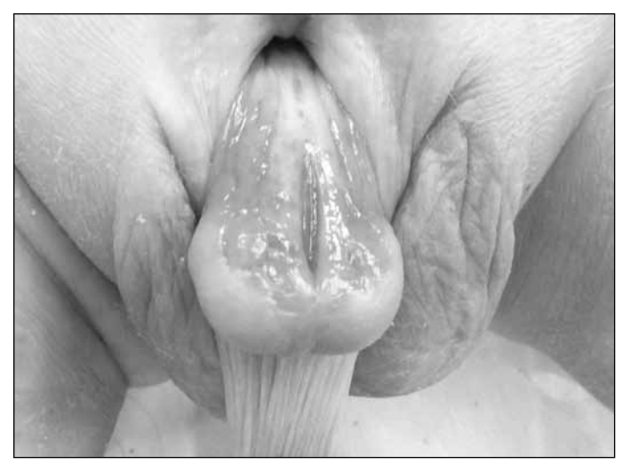
Fig 5. Epispadias.

Post-circumcision complications can be divided into