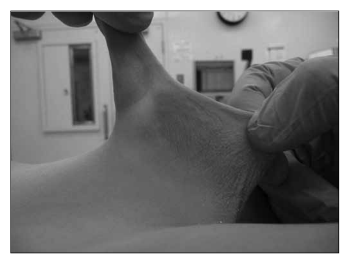
Fig 6. Peno-scrotal webbing.

early and late complications.<sup>81-87</sup> Early complications include bleeding, infection, glans necrosis/amputation, delayed or early slippage of circumcision devices, and very rarely, death. Late complications include inadequate skin removal, inclusion cysts, adhesions and skin bridges, suture sinus tracts, ventral curvature, secondary buried penis and phimosis, urethro-cutaneous fistulae, and meatal stenosis.<sup>87</sup>