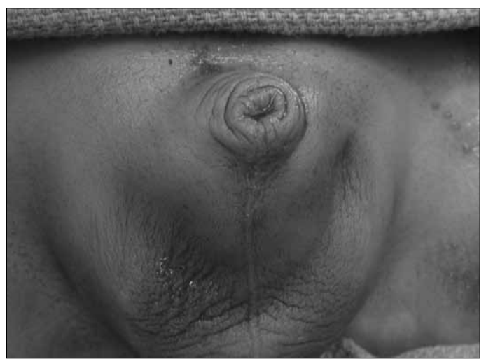
Fig 7. Concealed penis.

variables can potentially impact complication rates (Level 4, Grade D).