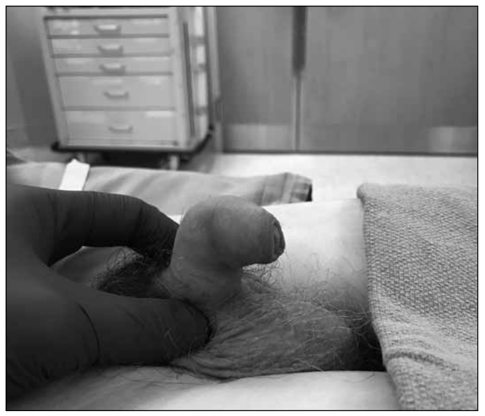
Fig 8. Ventral curvature.