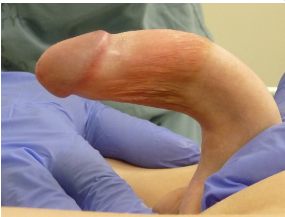
Fig 9. Megameatus intact prepuce hypospadias variant.