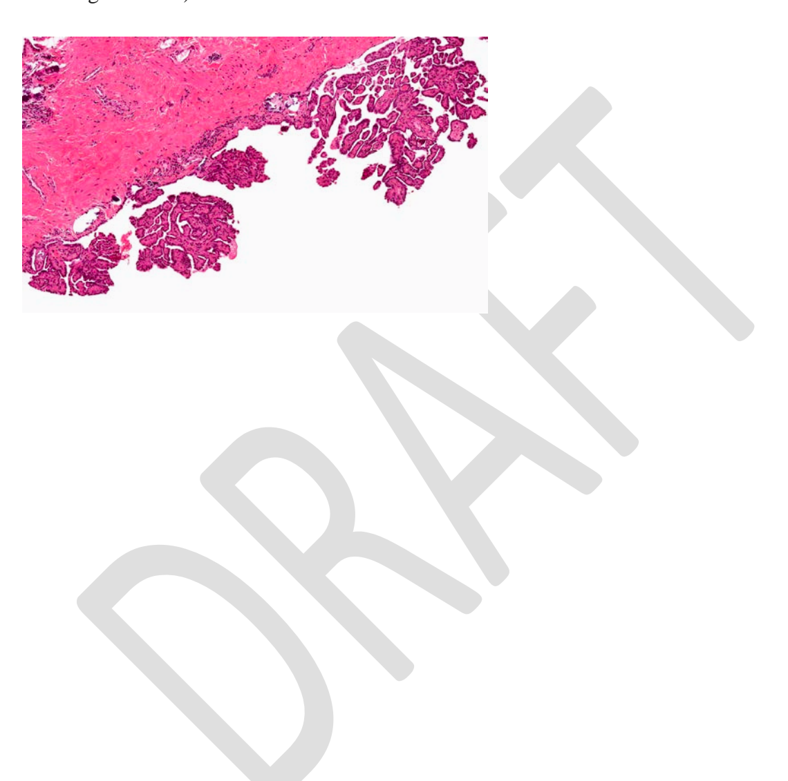
Fig. 1. Photomicrograph of lesion submitted for intraoperative consultation (cryosection), showing papillary excrescences on the surface of the tunica vaginalis (hematoxylin and eosin, 10x magnification).