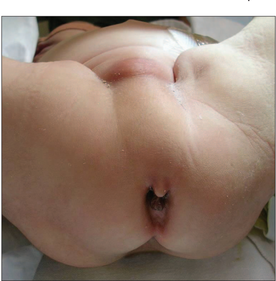
Fig. 1. This photograph shows a cloacal malformation, with a single opening seen at the perineum.

We collected data regarding pre- and postoperative hydronephrosis, vesicoureteral reflux (VUR) and split differential renal function. Renal outcome was evaluated based on glomerular filtration rate (GFR) and age-adjusted serum creatinine values ( \mu mol/L). GFR was measured by plasma creatinineethylenediaminetetraacetic acid and corrected to 1.73 m<sup>2</sup> body surface area. Urinary continence