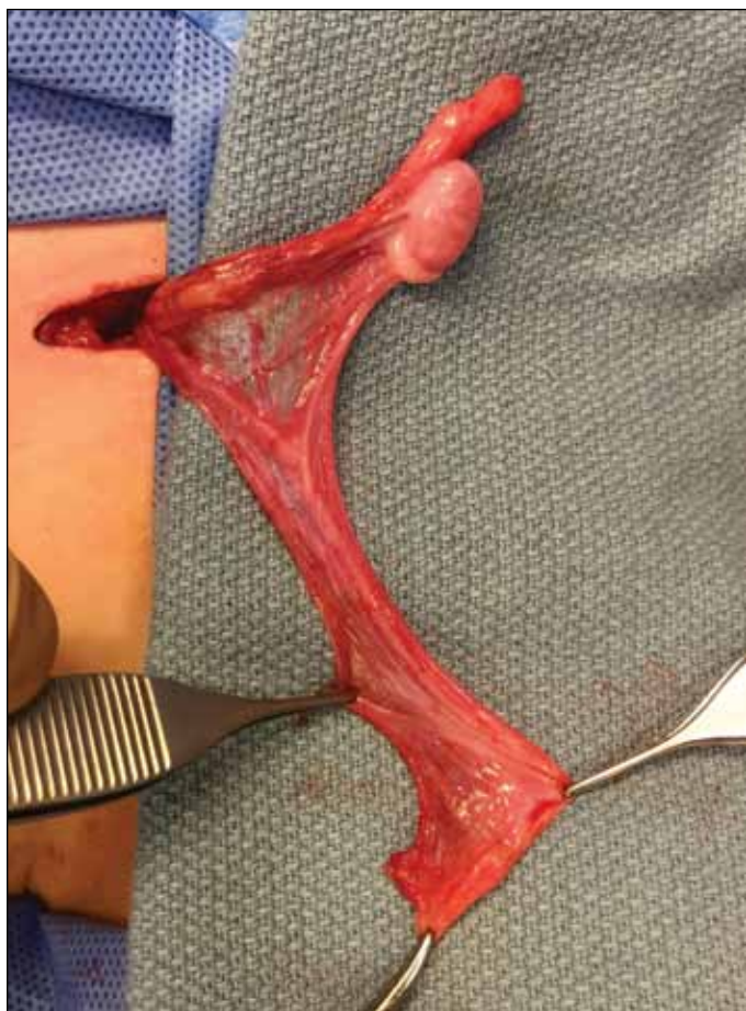
Fig. 4. Appearance of long loop vas deferens, which is rarely associated with undescended testis.

sels, than with the Fowler-Stephens technique. 22 However, we have seen excellent results with a two-stage Fowler-Stephens gubernaculum-sparing laparoscopic orchidopexy for intra-abdominal testes, as measured by preservation of testicular blood flow on postoperative Doppler ultrasound. 21