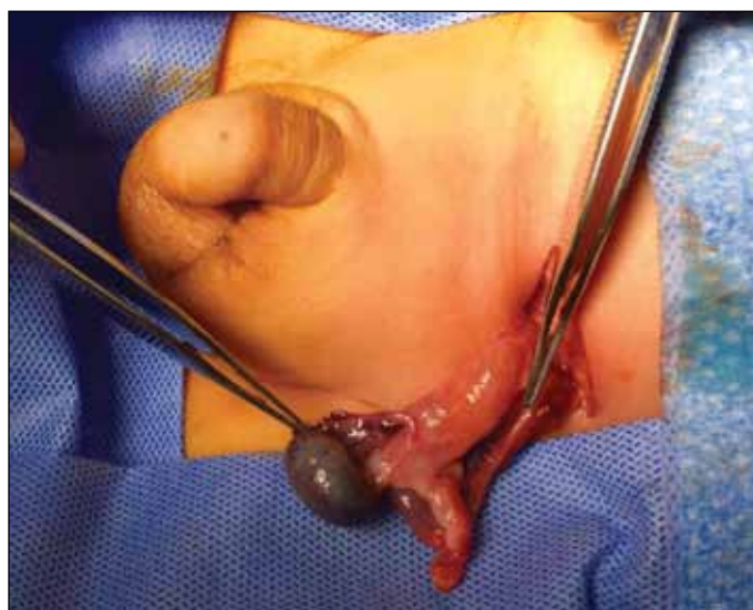
Fig. 2. Testicular torsion on an undescended testis.

Psychological distress is more likely in the parents than the pre-pubertal child, so parents should be reassured about the excellent outcomes for fertility and low risk of cancer in boys with unilateral UDT. A teenager with one testicle can be offered a testicular prosthesis.