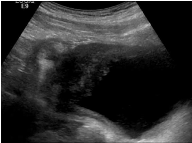
Fig. 1. Ultrasound image of the 7.7×5.7×7.3 cm mass extending from the right bladder wall. There appears to be perivesicular involvement which is highly suspicious for a high-grade tumour, such as a urothelial or urachal neoplasm.

The bacterium itself is not considered pathogenic in non-immunocompromised individuals, but circumstantial evidence suggests that mucosal trauma and infection by other organisms permits opportunistic invasion. 3 The progression of infection is slow. Common symptoms of bladder actinomycosis include hematuria, irritative voiding symptoms and lower abdominal pain. These can be accompanied by constitutional symptoms and mass-effect, such as obstruction or visceral pressure sensation. 7,8 Due to non-specific symptom profiles, clinical diagnosis of actinomycosis is made with difficulty.