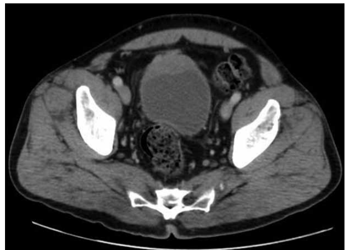
Fig. 4. The 3-month follow-up computed tomography post-transurethral resection of the bladder tumour and antibiotic treatment. There is improvement of the bladder wall as it is no longer globally thickened. As well, the mass is reduced in size and the perivesicle tissue change has also resolved.