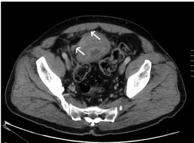
Fig. 3. A computed tomography slice prior to transurethral resection showing thickened bladder wall as well as the broad base of the original mass. There is also possible perivesicle involvement as marked by the white arrows.

Diagnosis of vesicular actinomycosis is often delayed due to the process of investigating the possibility of a urothelial malignancy, with vesicular and urachal neoplasms carrying greater indices of suspicion. Sulfur granules are often seen in biopsy specimens, but may also be detected in urine cytology as an initial clue to the etiology. 7,9 Microscopic analysis of tissue should demonstrate Gram positive bacilli with the appearance of filaments and hyphae. Inflammatory tissue change should also be present. 9,10 Definitive diagnosis requires bacterial cultures or histological identification of the microbiota in question.