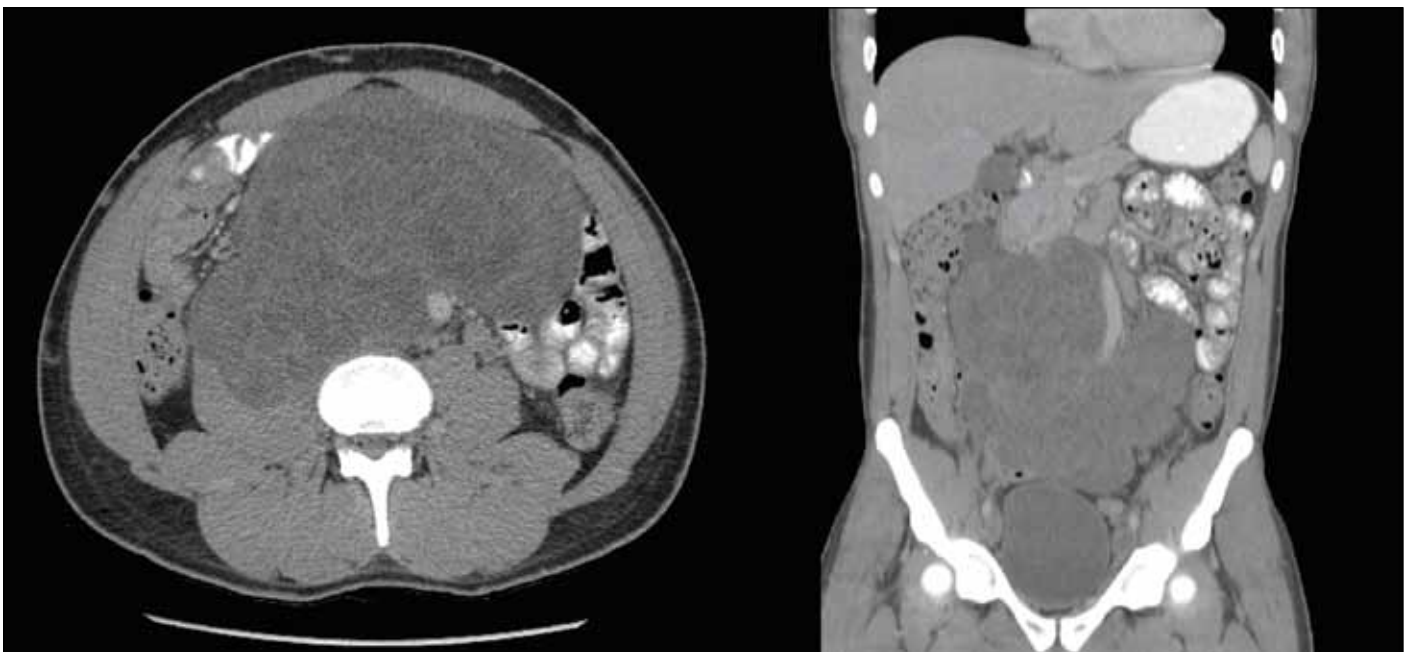
Fig.2. Rapid interval progression of retroperitoneal mass on axial and coronal contrast-enhanced computed tomography images over the course of three months.

had noted that it had slightly increased in size over the course of three months. Scrotal ultrasound revealed a solid vascularized lesion with cystic components within the soft tissues of the superior left hemiscrotum, corresponding to the palpable abnormality (Fig. 3). The mass was resected without complication. Surprisingly, pathology revealed the specimen to be composed entirely of mature teratoma. Margins were negative. The patient is currently on surveillance and has remained disease-free for six months.