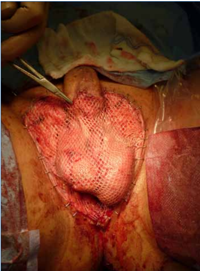
Fig. 3. Intraoperative photograph showing the split-thickness skin graft covering the testes.

well-adapted skin grafts, and the absence of penile or scrotal tenderness, pain, erectile dysfunction or recurrence of any lesions. Demir and colleagues 5 and Yagmurlu and colleagues 11 reported cases of scrotal lymphangioma circumscriptum involving subcutaneous tissue layers, where the lesions were removed along with subcutaneous tissues and successfully prevented recurrences after STSG reconstruction and z-plasty skin flap closure, respectively. Hence, surgical excision is a safe and effective method for treating genital lymphangiomatosis.