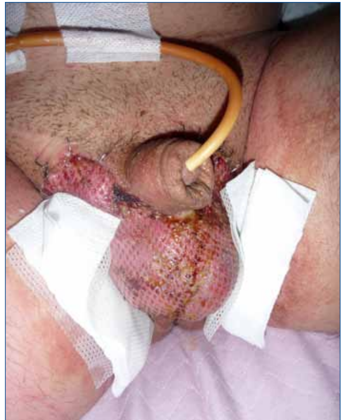
Fig. 4. One-month postoperative photograph showing the reconstructed scrotum.

In cases where tissue loss is significant, the method of primary intention healing whereby the wound is suture closed becomes impossible, and surgical treatments using skin flaps or grafts are preferable. 12 Appropriate contact between the skin graft and recipient bed is crucial to graft survival, and tie-over bolster dressing is usually enough to secure the graft in place over flat, non-granulated and non-motile recipient beds. 13 When the wounds involve surfaces that are irregular, exudative, or subject to repeated motion, grafting becomes more difficult, and VAC is the more effective technique in securing grafts onto recipient beds. 13 The device consists of an open-cell foam with an embedded evacuation