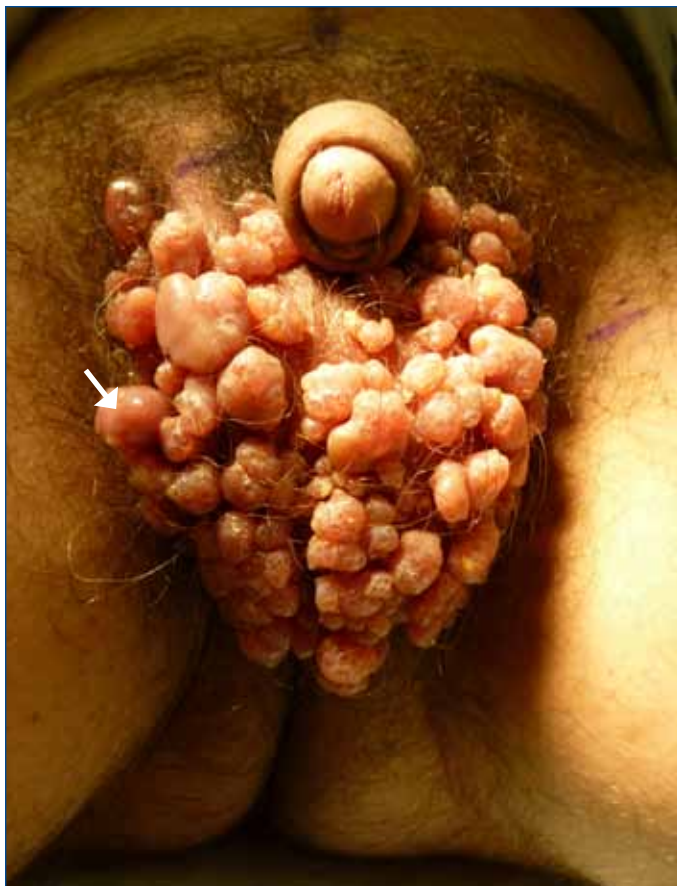
Fig. 1. Preoperative photograph showing the lymphangioma lesions on the scrotum.

capillary or simple lymphangiomas are thin-walled dilated vessels in a stroma of rich cellular connective tissue; (2) cavernous lymphangiomas have larger dilated lymphatics that are spongy and compressible, and may either be empty or filled with blood or lymph; and (3) cystic lymphangiomas, or cystic hydromas, are congenital macroscopic lymphatic that may intercommunicate or be separated by fibrous septa. 3