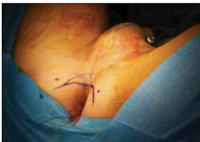
Fig. 1. Inverted U transperineal incision. Ischial tuberosities marked out. Provides excellent exposure of rectum and urethra. Further urethral reconstruction using buccal mucosa grafting can be undertaken if needed.

The rectum is repaired in two layers taking care to invert the rectal mucosa. Large urethral defects are closed with buccal mucosa graft as needed. Otherwise, the urethral defect is closed with 3-0 vicryl interrupted sutures. We perform our own gracilis flap harvest. The left gracilis muscle is preferred and tunneled into the perineum under colles fascia and fascia lata. The apex of the muscle graft is spread fixed to the anterior rectal wall and bladder base beyond the fistula repair. The edges of the gracilis muscle are secured to the superficial perineal fascial layers (Fig. 2). The operative area is closed in standard fashion with a closed suction drain inserted at the left thigh harvest site and a penrose drain in the perineum. Foley and suprapubic catheters are left to drainage. Patients are kept on intravenous antibiotics for 48 hours and usually discharged after two to three days. Voiding cytourethrogram is performed four weeks postoperatively and catheters removed shortly thereafter. Cystoscopy is performed three to six months postoperatively.