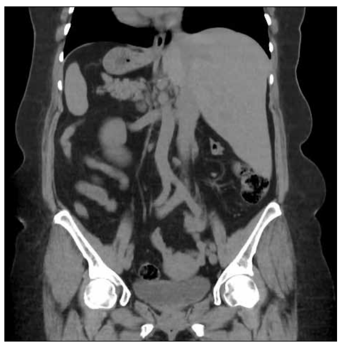
Fig. 1. A computed tomography scan showing all intra-abdominal organs positioned inversely in a mirror image.

toperative pain and high morbidity associated with open approach, the use of laparoscopy for treating benign and malignant disease of the upper urinary tract has become common. The benefit of a less invasive surgical approach to urological disease is based on patient comfort, improved cosmetic results, and shorter convalescence compared to open surgery.<sup>7,8</sup>