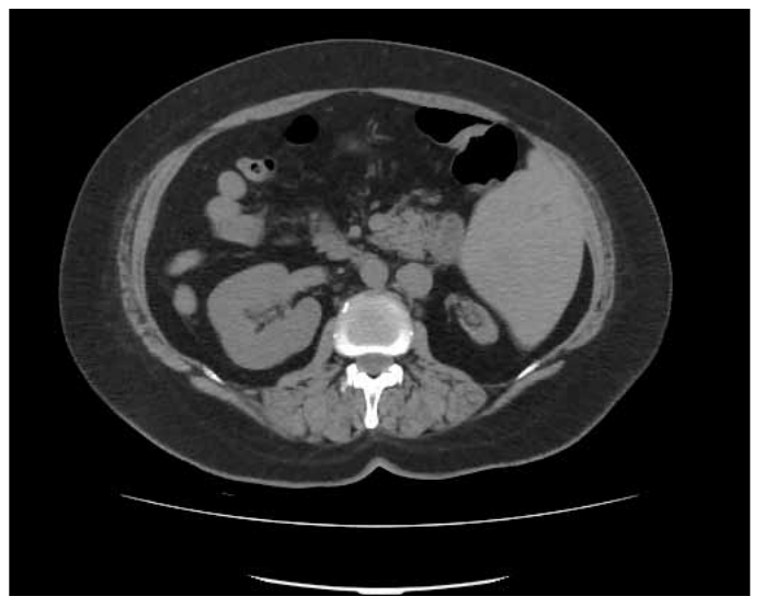
Fig. 2. A computed tomography scan showing a left hypoplasic kidney with situs inversus totalis.

Renal anomalies, including agenesis, dysplasia, hypoplasia, ectopia, polycystic kidney, and horseshoe kidney, have been reported in SIT. Because of the association between situs inversus and cardiac, pulmonary, and renal anomalies, patient management with situs inversus and urologic disease requires careful preoperative evaluation.<sup>2</sup>