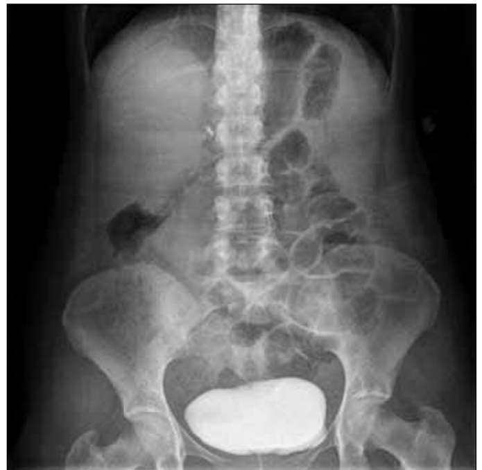
Fig. 3. Postoperative cystography.

One study noted reflux in 83 of 89 diverticula associated with ureteric units. 5 Other considerations in the evaluation