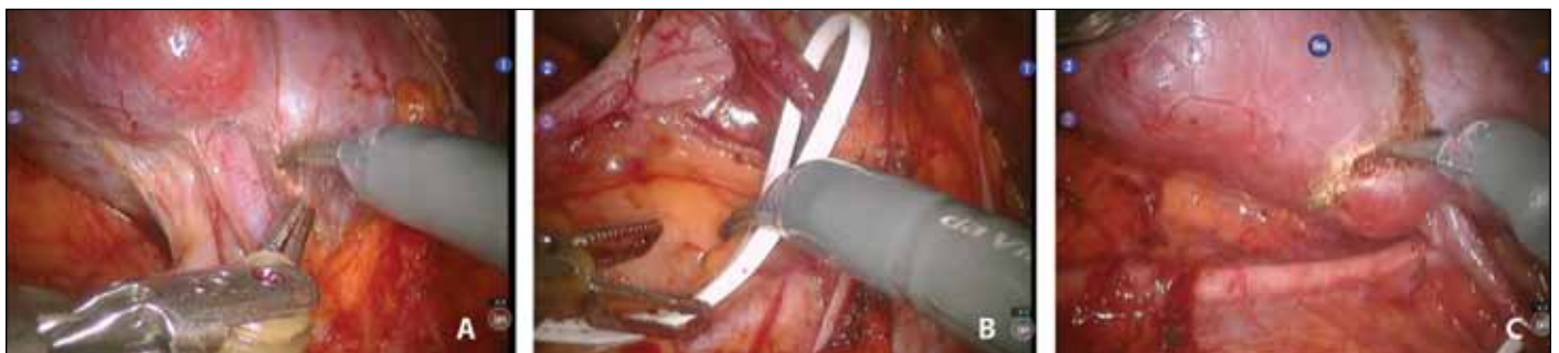
Fig. 2. A: Dissection of sub-segmental arterial supply to the tumour. B: Isolation of sub-segmental arterial supply to the tumour. C: Excision of the renal tumour.

Between January 2012 and June 2013, there were 21 patients who underwent zero ischemia RAPN and included in this study (n = 21). All baseline demographic data were similar