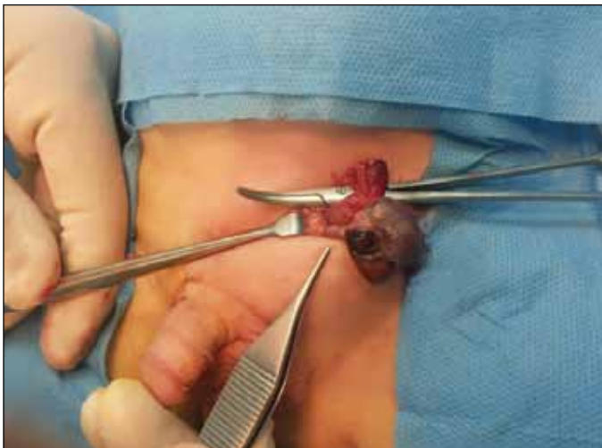
Fig. 3. Surgical exploration of the scrotum confirms a non-viable left testis with 1080-degree intravaginal torsion.

tion of testicular hemodynamics support our suggestion that SR-NIRS assessment of spermatic cord tissue oxygenation should be explored further.