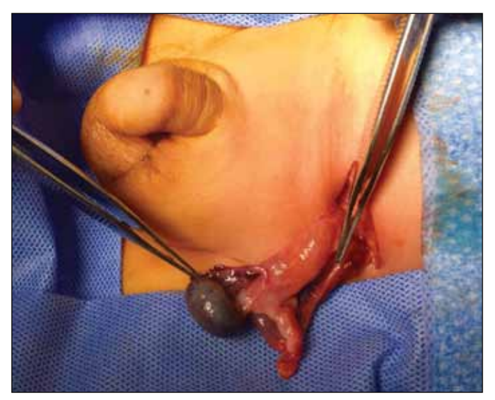
Fig. 2. Testicular torsion on an undescended testis.

Psychological distress is more likely in the parents than the pre-pubertal child, so parents should be reassured about the excellent outcomes for fertility and low risk of cancer in boys with unilateral UDT. A teenager with one testicle can be offered a testicular prosthesis.