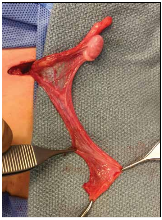
Fig. 4. Appearance of long loop vas deferens, which is rarely associated with undescended testis.

sels, than with the Fowler-Stephens technique.<sup>22</sup> However, we have seen excellent results with a two-stage Fowler-Stephens gubernaculum-sparing laparoscopic orchidopexy for intra-abdominal testes, as measured by preservation of testicular blood flow on postoperative Doppler ultrasound.<sup>21</sup>