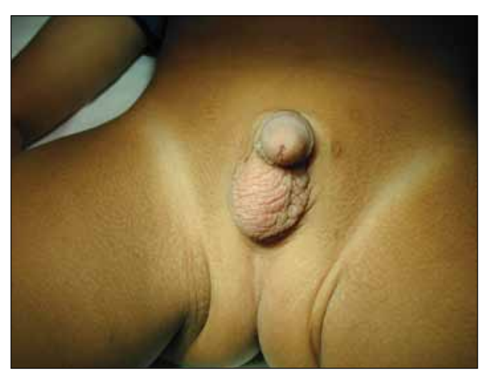
Fig. 1. Left true undescended testis with underdeveloped ipsilateral hemiscrotum — typical finding on physical examination of these boys.

The most important distinction is between palpable vs. nonpalpable testis. Other terms used to describe the position of the palpable testis are peeping (sliding in and out of the internal inguinal ring), canalicular, extra-canalicular (superficial inguinal pouch), suprapubic (high scrotal/gliding), or ectopic.<sup>16</sup> Non-palpable testes may be intra-abdominal, absent, atrophic, or inguinal (but difficult to palpate). Intraabdominal testes are usually located just inside the internal ring, but may be anywhere between this anatomical structure and the lower pole of the kidney.