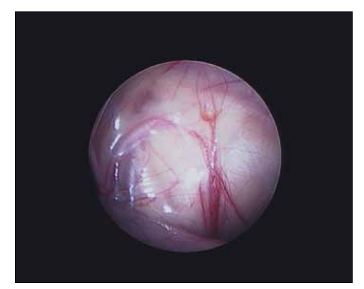
Fig. 3. Laparoscopic view showing blind-ending vas and testicular vessels with hemosiderin deposit, indicative of vanishing intra-abdominal testis.

Performing the Fowler-Stephens in two stages (first ligating the testicular vessels then performing orchidopexy 6–12