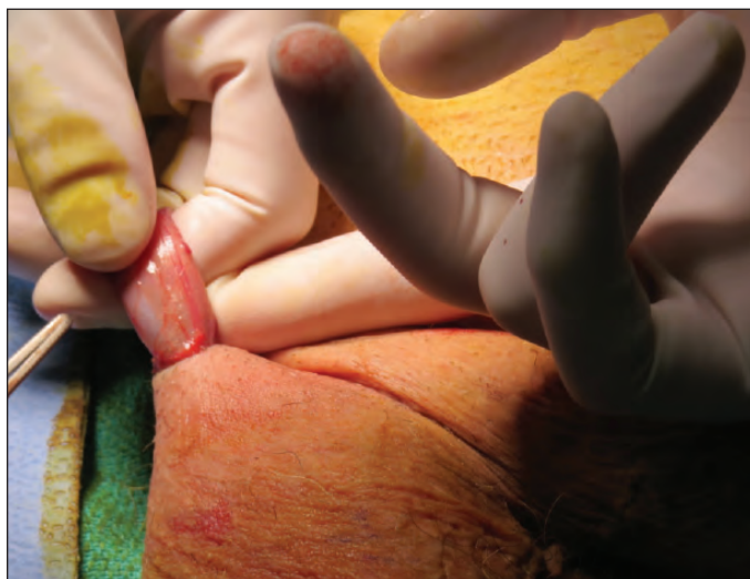
Fig. 3. Gentle pressure on the scrotum mobilizes the hydrocele sac into the wound.

Hydrocelectomy is a commonly performed urologic procedure and is typically performed via a trans-scrotal approach.