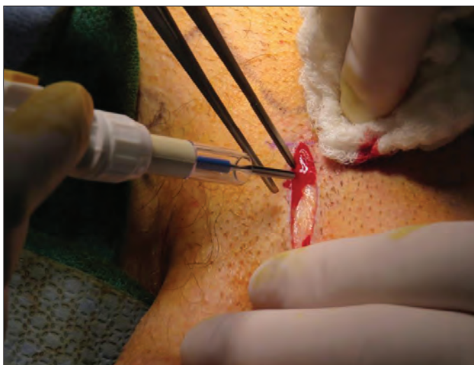
Fig. 1. A 2–3 cm incision is made over the subinguinal spermatic cord.

discomfort (n=7) and cosmesis (n=5). Mean operating room time was 35 minutes (range 23–57 min) for the procedure. All patients were followed up in the outpatient clinic at 3–5 weeks (Fig. 7) and again at three months. One patient developed a superficial wound infection (Clavien Grade II) and one patient demonstrated some fluid accumulation (Clavien Grade I) that did not require further intervention. No patients experienced a scrotal hematoma. Importantly, there was a complete absence of scrotal edema and wound discharge in all patients. As well, none of the 12 patients required repeat hydrocelectomy.