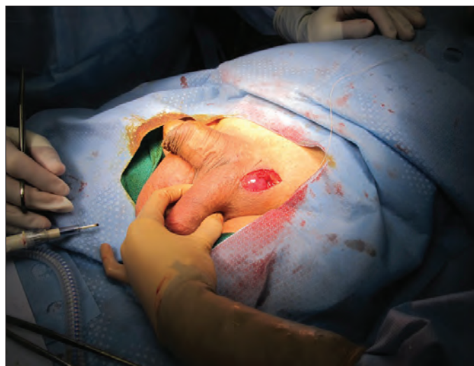
Fig. 6. Gentle traction on the scrotum pulls the testis back into orthotopic position.