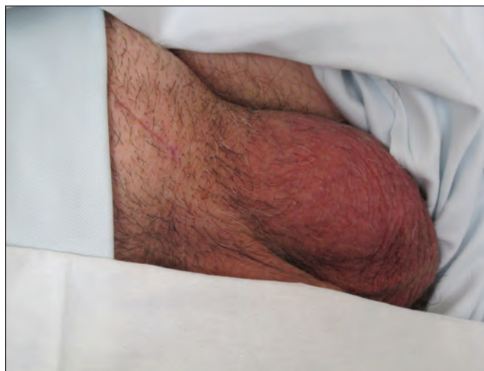
Fig. 7. Results at the three-week postoperative visit.

The “Snip, Stitch & Tug” hydrocelectomy is associated with a small incision, minimal swelling, and a low complication/recurrence rate.