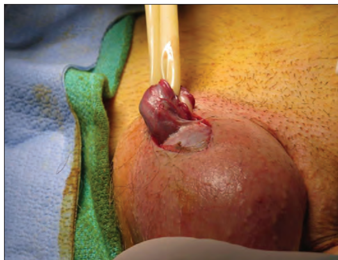
Fig. 2. Spermatic cord is isolated and elevated in the wound.

Trans-scrotal repairs have been widely accepted as the standard of care. Despite this, large series have identified a 20% complication rate—including abscess/infection, hematoma, and recurrence of hydrocele—in the management of this benign condition. 3-4 Anecdotally, these procedures are commonly associated with weeks to months of persistent scrotal swelling and serous incisional drainage.