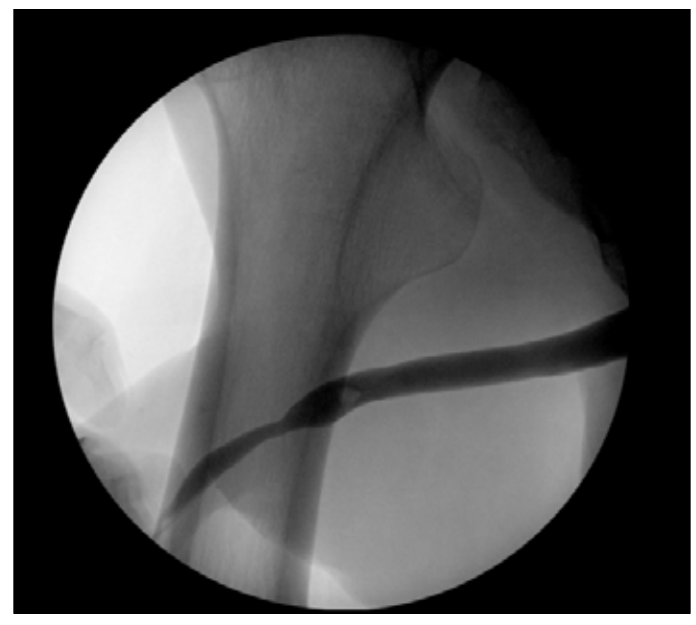
Fig. 3. Retrograde urethrogram eight weeks after the injury (four weeks post-catheter removal).

would have been appropriate. This patient is still at risk of developing a symptomatic urethral stricture, however, the preservation of the majority of the urethral plate and minimal disruption to the tissue and blood supply of the surrounding penile and scrotal skin with this single-stage procedure should maximize the operative possibilities should he need a future urethroplasty. He was counseled about the risks of future self-urethral instrumentation, referred to his family physician for psychiatric care, and followup will be carried out to monitor for voiding dysfunction.