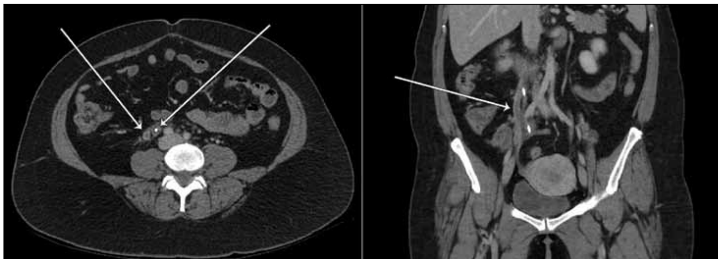
Fig 2. Postoperative computed tomography images showing right ovarian vein thrombosis (arrow) in transverse ( left ) and coronal ( right ) views.

Patients with OVT typically present with persistent unexplained fever and abdominal pain one week after delivery or surgery. Approximately 80–90% of OVT occurs on the